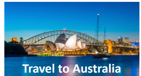
Travel to Australia