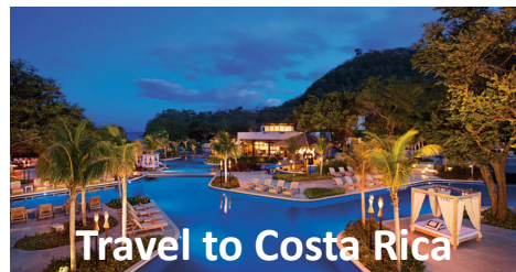
Travel to Costa Rica

Our 2021 trips. You qualify by sponsoring, increasing rank and promoting directors on your team.